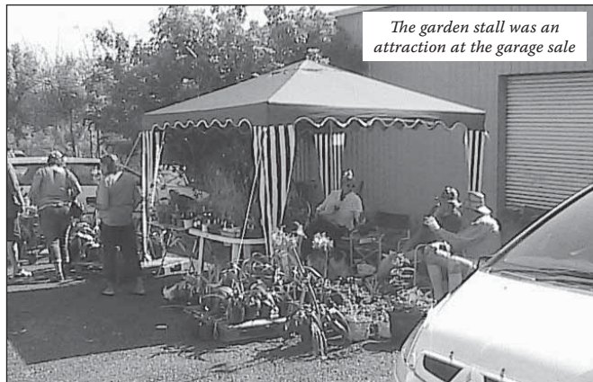
The garden stall was an attraction at the garage sale

second prizes for her knitting in the Culcairn Show. Madge has donated one of her first prize items, a ladies bed jacket, to the Shed to raise money. It is a beautiful item which will be used in a fund raiser early next year.